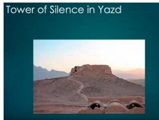
Tower of Silence in Yazd